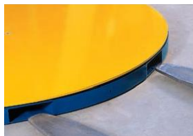
Easy to move using a forklift