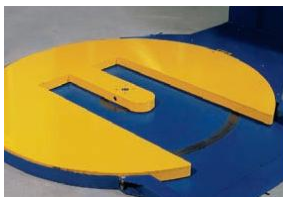
Tray open, easy to load with a hand pallet truck. Equipped with a safety device for legs