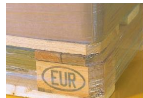
Down wrapping on turntable