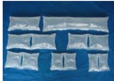
Different types of wedging Airpad cushions