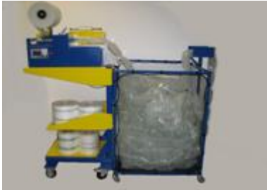
The air cushion storage bin